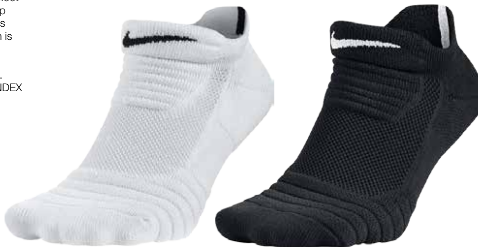
101 White/White/(Pure Platinum)