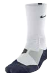
144 White/Midnight Navy