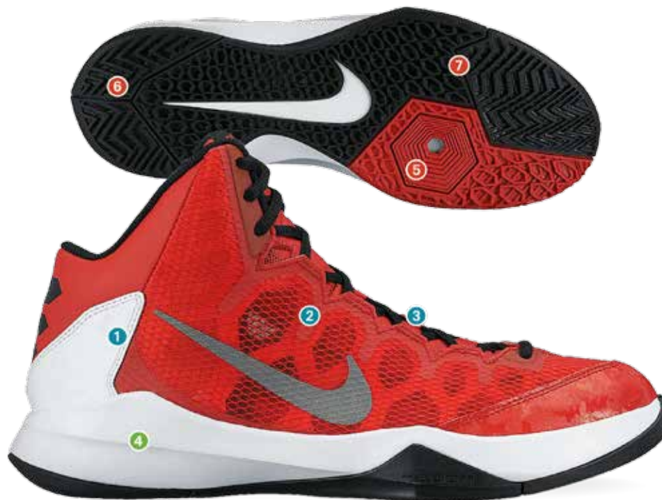
601 University Red