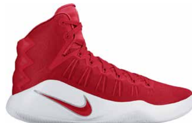
662 University Red/Uni Red-White