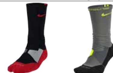
002 Black/Uni Red