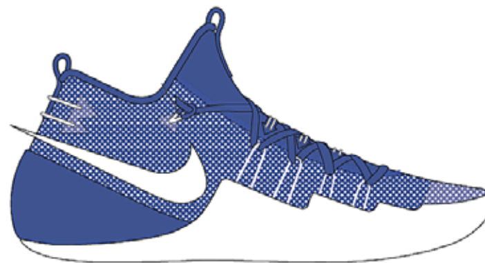
411 Game Royal/White