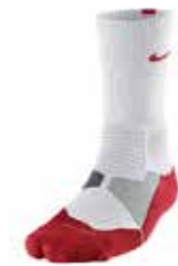
160 White/Varsity Red