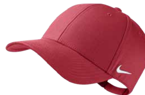
657 University Red/White