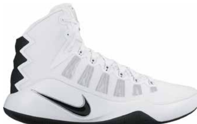
100 White/Black-Met Silver