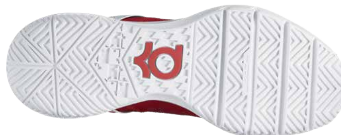
616 Bright Crimson/White