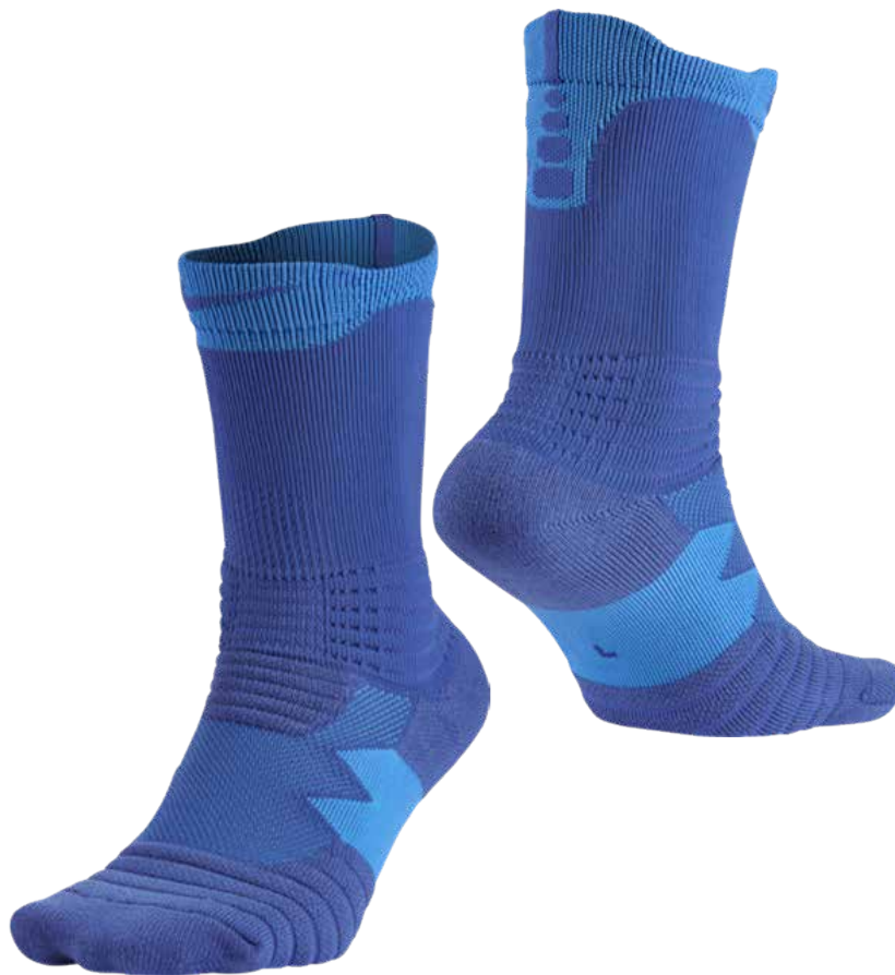
480 Game Royal/Photo Blue/(Game Royal)