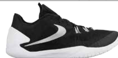
001 Black/Metallic Silver-White