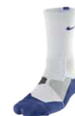
143 White/Game Ryl