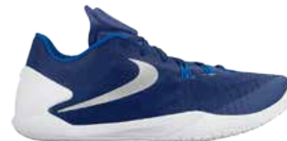
401 Mid Navy/Met Silver-White-Pht Blue