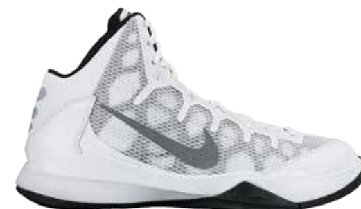
100 White/Metallic Silver-Black