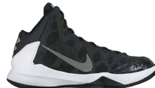
002 Black/Metallic Silver