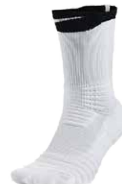
101 White/White/(Pure Platinum)