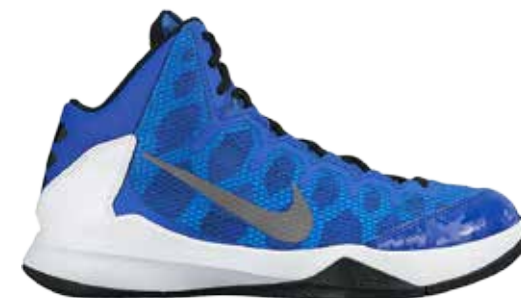
401 Game Royal/Metallic Silver-White-Blue Hero