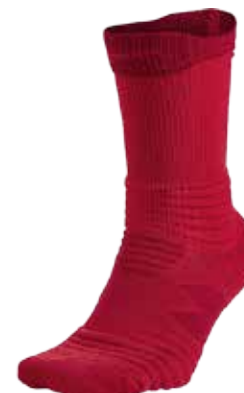
657 University Red/Gym Red/(University Red)