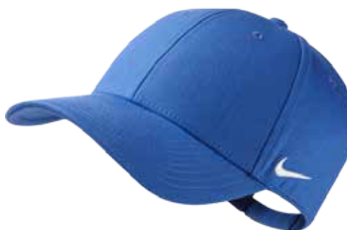
463 Royal Blue/White