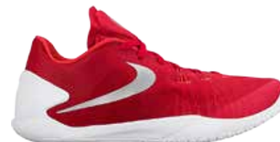
601 Uni Red/Met Silver-White-Bright Crimson