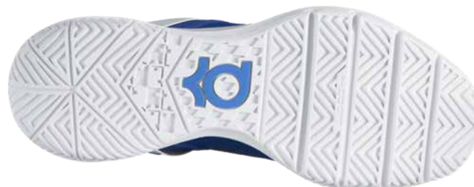
411 Game Royal/White